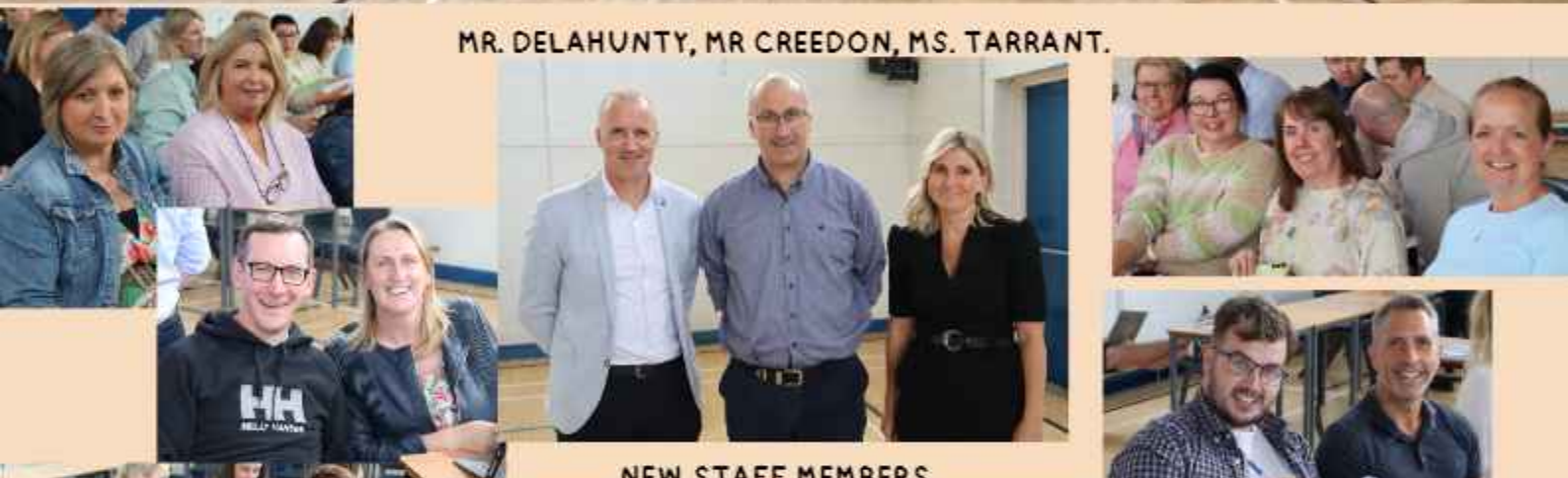
NEW STAFF MEMBERS