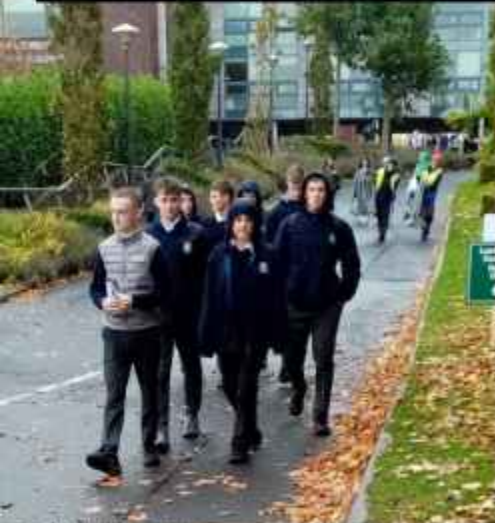
COLÁISTE DÚN IASCAIGH CAHIR 6TH YEAR STUDENTS ENJOYED UL/TUS/MIC OPEN DAY IN LIMERICK.