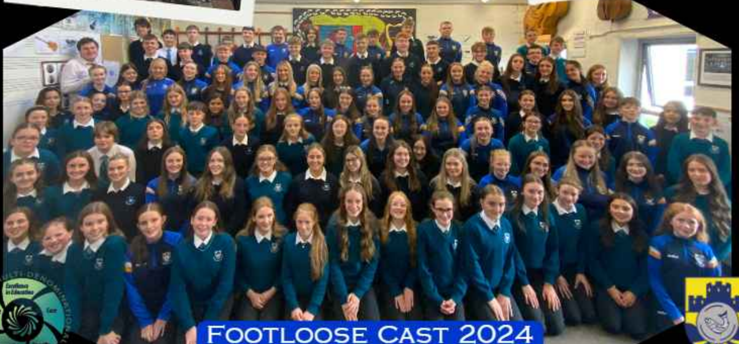
FOOTLOOSE CAST 2024