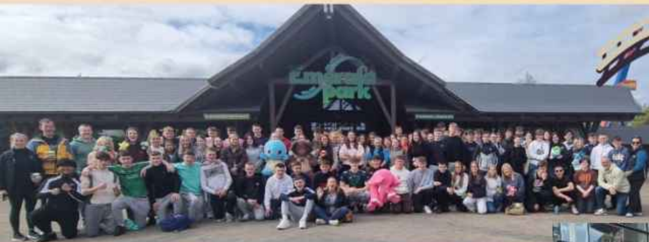
6TH YEAR STUDENTS VISITED EMERALD PARK!